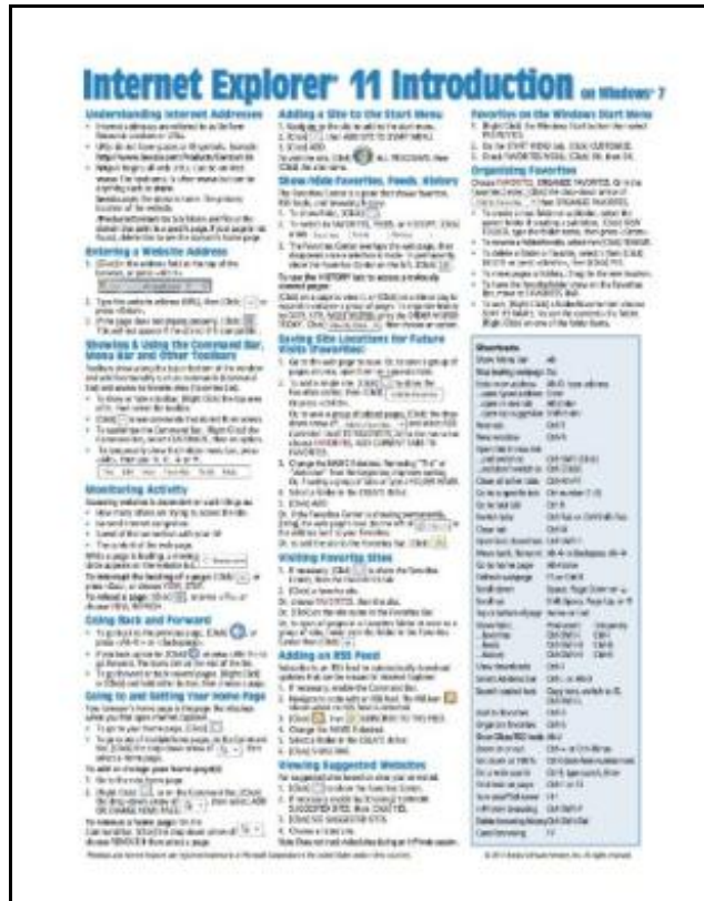
Filesize: 5.64 MB